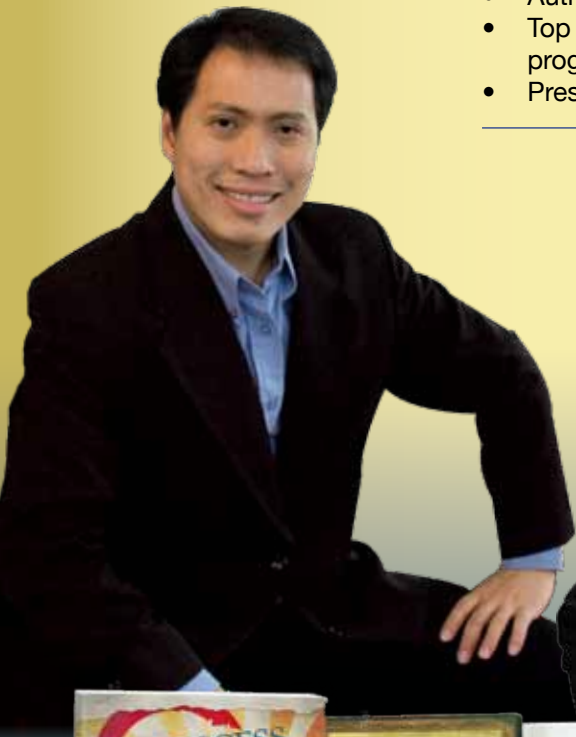
DR. JOHN C. MAXWELL

11 December 2010 Intel University, MPH (PG9)